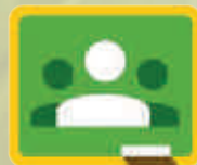
GOOGLE CLASSROOM™ INTEGRATION