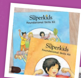
The Superkids Foundational Skills Kit