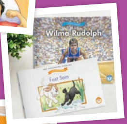
The Superkids Reading Resources